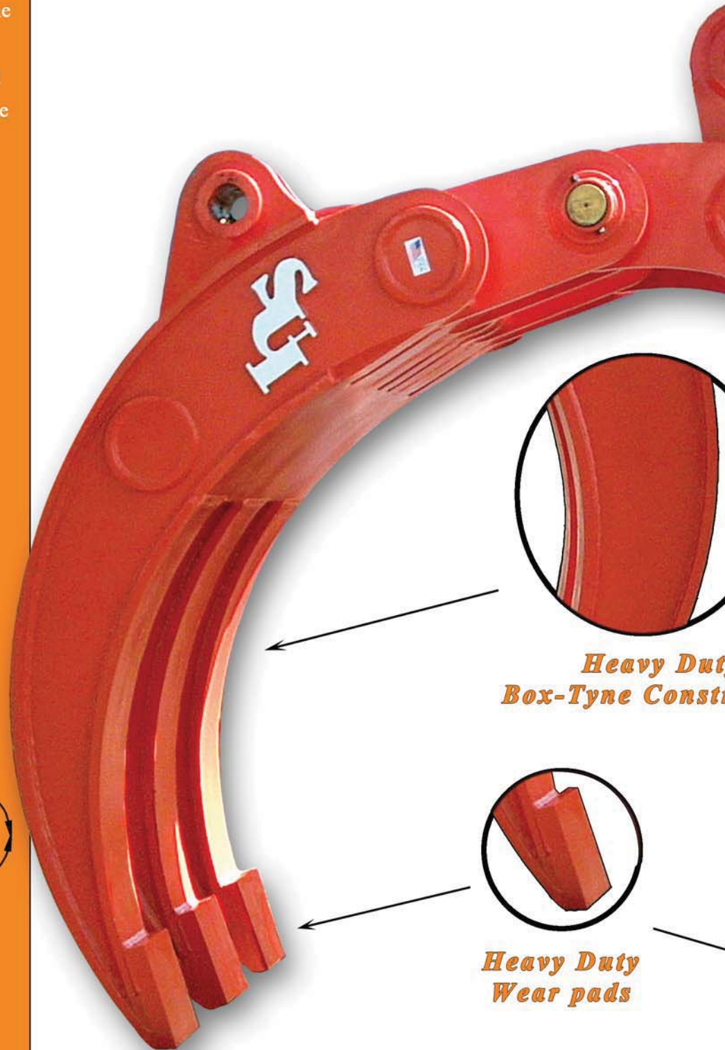
Heavy Duty Box-Tyne Construction

The use of the SUI box-tine design and the use of high tensile, high alloy, abrasion resistant steel creates a minimal weight, yet maximum strength tool. SUI grapples can withstand the full digging force of the excavator on each tine.